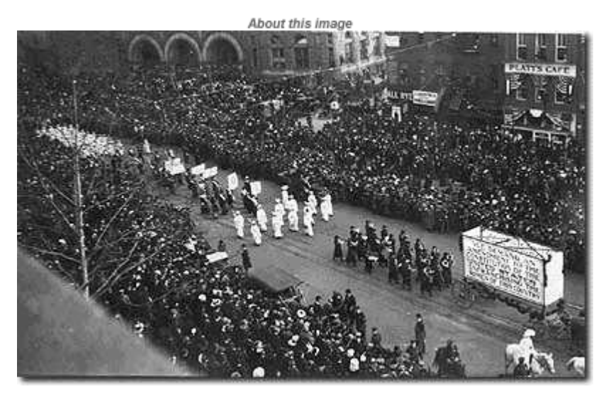
Crowd gathers in Washington, D.C., on March 3, 1913 to witness a parade for women's suffrage

In addition to the NCL, there were a host of other reform organizations headed by women: the Woman's Trade Union League, the General Federation of Women's Clubs, the National Council of Jewish Women, and the National Council of Colored Women. These groups saw the state as a potentially beneficial agent of social welfare.