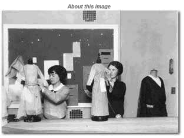
Students at work in University of Wisconsin "home economics laboratory"

"Education is greatly to be desired. But it is better that the future matrons of this state should be without a university training, than it should be produced at the fearful expense of their ruined health. Better that the future mothers of our state should be robust, hearty,